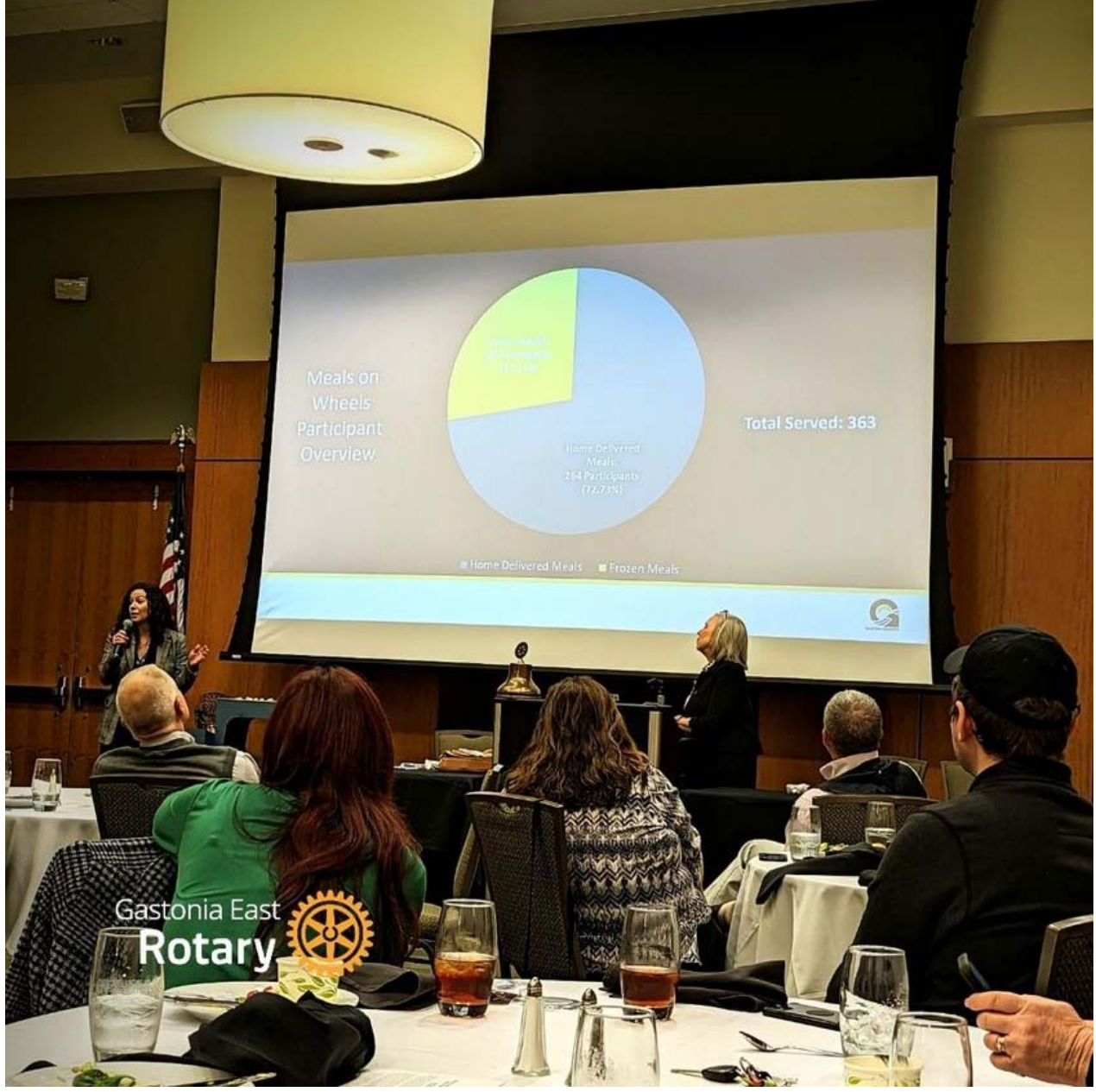
Meals on Wheels Presentation

Meeting Link: https://us02web.zoom.us/j/83451707408?pwd=UG55djNIRGRBdGImdIFSRG80MXY3UT09